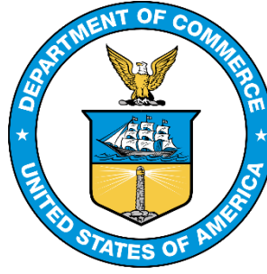
DEPARTMENT OF COMMERCE