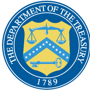
DEPARTMENT OF THE TREASURY