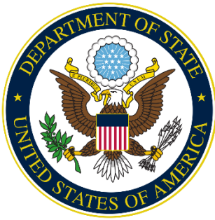
DEPARTMENT OF STATE