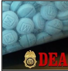
Example of counterfeit pills containing fentanyl seized by DEA

The GONZALEZ PENUELAS DTO is increasingly engaged in the distribution of M-30 fentanyl pills