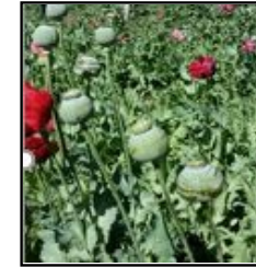
Opium poppy fields in Sinaloa, Mexico

The GONZALEZ PENUELAS DTO is a major supplier of raw opium gum and heroin