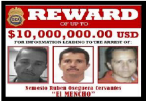
CJNG Leader Designated April 8, 2015