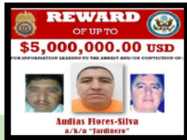
CJNG Regional Commander Designated April 13, 2021