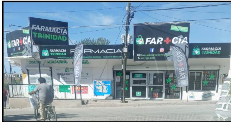
FARMACIA Y MINI SUPER TRINIDAD Nogales, Sonora, Mexico