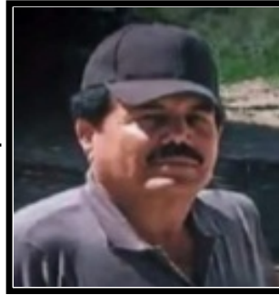
Ismael ZAMBADA GARCIA AKA: "EL MAYO"

U.S. Department of the Treasury Office of Foreign Assets Control