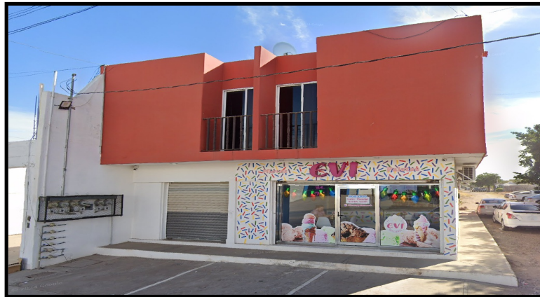
NIEVES Y PALETAS EVI Culiacan, Sinaloa; Pueblos Unidos, Sinaloa; Tacuichamona, Sinaloa