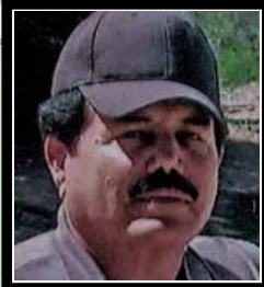
Ismael ZAMBADA GARCIA AKA: "EL MAYO" SINALOA CARTEL LEADER Sanctioned May 31, 2002

Transnational criminal organization involved in human smuggling, drug trafficking, and weapons trafficking