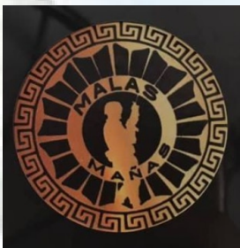
Malas Mañas logo