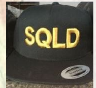
Malas Mañas hat featuring slogan