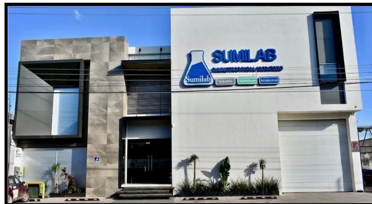
SUMILAB, S.A. DE C.V. R.F.C.: SUM010525IF9 Culiacan, Sinaloa, Mexico