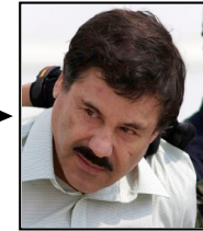
Joaquin GUZMAN LOERA A.K.A.: "El Chapo" *INCARCERATED*