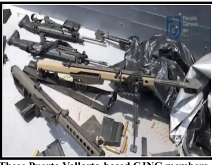
These Puerto Vallarta-based CJNG members orchestrate assassinations of rivals and politicians using high-powered weaponry.