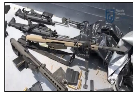
These Puerto Vallarta-based CJNG members orchestrate assassinations of rivals and politicians using high-powered weaponry.