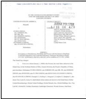
Indicted in Northern District of Ohio Drug Trafficking Charges August 2018