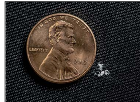
2mg of fentanyl Lethal dose in most people