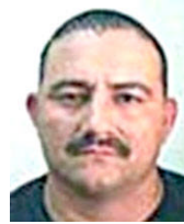
Dairo Antonio USUGA DAVID