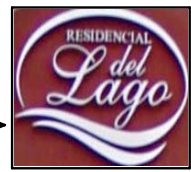
RESIDENCIAL DEL LAGO (Residential Community) Cerrada Diego Rivera No. 347, Col. Desarrollo Urbano 3 Rios Culiacan, Sinaloa, Mexico