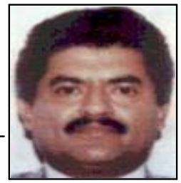
Juan Jose ESPARRAGOZA MORENO (a.k.a. "El Azul")