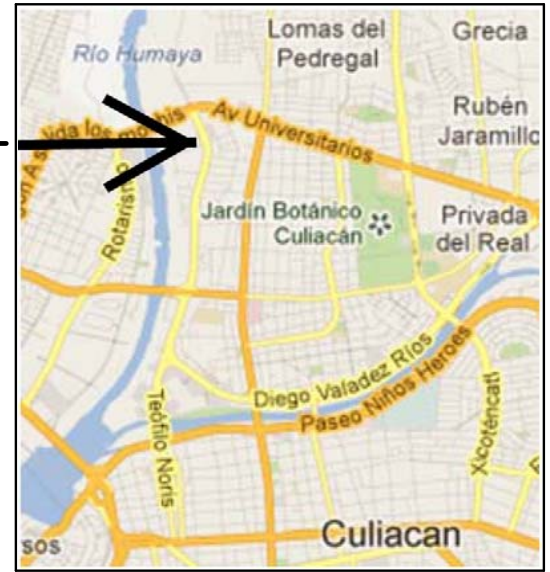
Culiacan, Sinaloa, Mexico