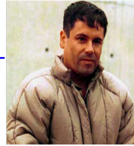
Joaquin "Chapo" GUZMAN LOERA

Indicted in Eastern District of NY on July 10, 2009