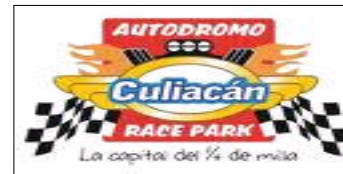
AUTODROMO CULIACAN RACE PARK Culliacan, Sinaloa