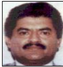
Juan Jose ESPARRAGOZA MORENO (a.k.a. "El Azul")