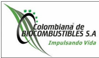
COLOMBIANA DE BIOCOMBUSTIBLES S.A. (a.k.a. COLBIO)

Companies owned, controlled, or directed by, or acting for or on behalf of, La Oficina de Envigado and/or individuals designated today