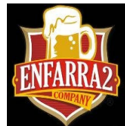
ENFARRADOS COMPANY S.A. Carrera 48 No. 46 Sur 150 Envigado, Antioquia, Colombia NIT # 900347098-6 (Colombia)