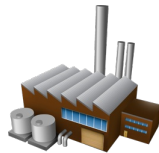
MEHRAN PAPER MILL F-11, S.I.T.E., Kotri, Sindh, Pakistan National Tax No. 25735349 (Pakistan)

All individuals wanted on INTERPOL Red Notices in connection with the March 1993 attack in India