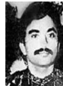
Chhota SHAKEEL a.k.a. Sheikh Shakeel AHMED