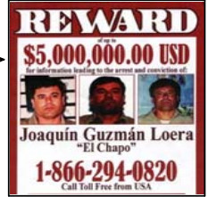
Reward for Information Leading to the Arrest and Conviction of GUZMAN LOERA