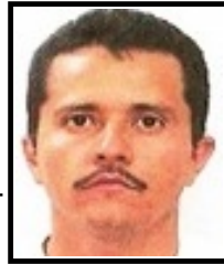
Nemesio OSEGUERA CERVANTES (a.k.a. Ruben OSEGUERA CERVANTES) (a.k.a. "Mencho") * FUGITIVE *