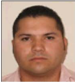
Fausto Isidro MEZA FLORES AKA: "Chapo Isidro" Designated by OFAC for playing a significant role in international narcotics trafficking on January 17, 2013

U.S. Department of Treasury Office of Foreign Assets Control Foreign Narcotics Kingpin Designation Act