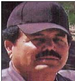
Ismael ZAMBADA GARCIA AKA: "El Mayo" Identified by the President as a Significant Foreign Narcotics Trafficker in May 2002

Plays a significant role in international narcotics trafficking