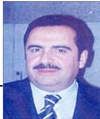
Hector BELTRAN LEYVA Designated December 2009