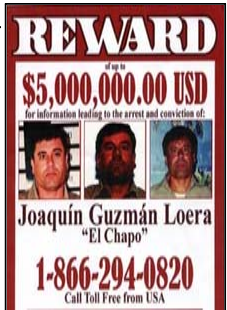
Reward for Information Leading to the Arrest and Conviction of GUZMAN LOERA