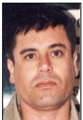
Joaquin GUZMAN LOERA (a.k.a. "El Chapo") DOB 25 Dec 1954; POB Mexico Leader of the SINALOA CARTEL; Identified by the President in 2001 as a Significant Foreign Narcotics Trafficker