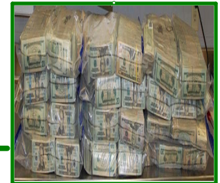
Drug proceeds smuggled from the U.S. to Mexico