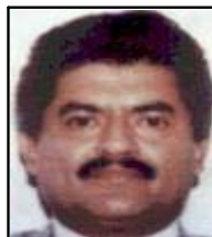
Juan Jose ESPARRAGOZA MORENO (a.k.a. "El Azul")

U.S. Department of the Treasury Office of Foreign Assets Control Foreign Narcotics Kingpin Designation Act