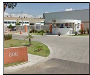
LA TIJERA PARQUE INDUSTRIAL

GRUPO IMPERGOZA, S.A. DE C.V. R.F.C. GIM-081015-SIA