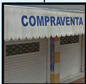
Compra Venta Gerpez Tulua (Valle), Colombia Matricula Mercantil No. 10375-1