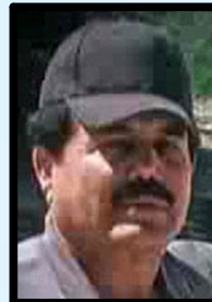
Ismael "El Mayo" Zambada Garcia Leader of Sinaloa Cartel