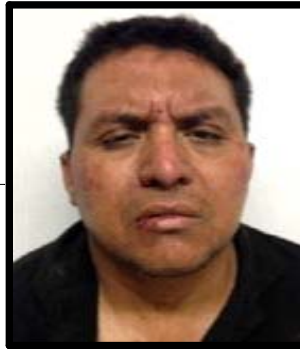
LOS ZETAS LEADER Miguel TREVINO MORALES Designated July 2009