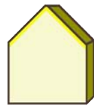
ASESORIA Y SERVICIOS ADMINISTRATIVOS, TECNICOS Y OPERATIVOS DUREL Jalisco, Mexico