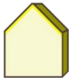
GRUPO COMERCIAL ROOL Jalisco, Mexico