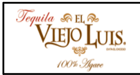
CASA EL VIEJO LUIS DISTRIBUIDORA a.k.a. Tequila El Viejo Luis Jalisco, Mexico