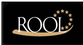
ROOL EUROPE AG Hamburg, Germany