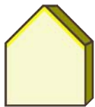
OPERADORA Y ADMINISTRADORA DE RESTAURANTES Y BARES RUDU Jalisco, Mexico